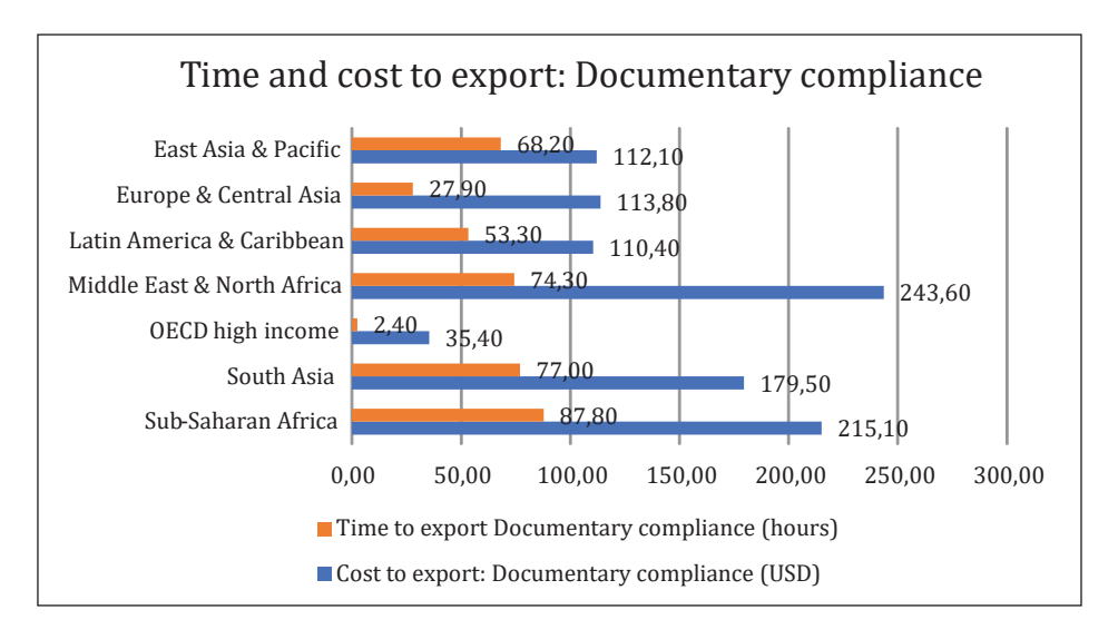
Figure 1 The time and cost associated with documentary compliance procedure (exporting a shipment of goods), in 2018